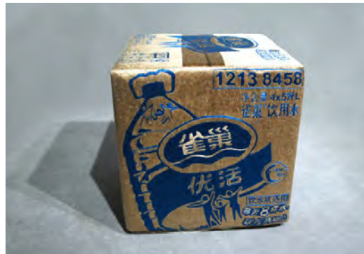
Danful Yang Packing me softly , 2014 Pearl Lam Galleries SOLD