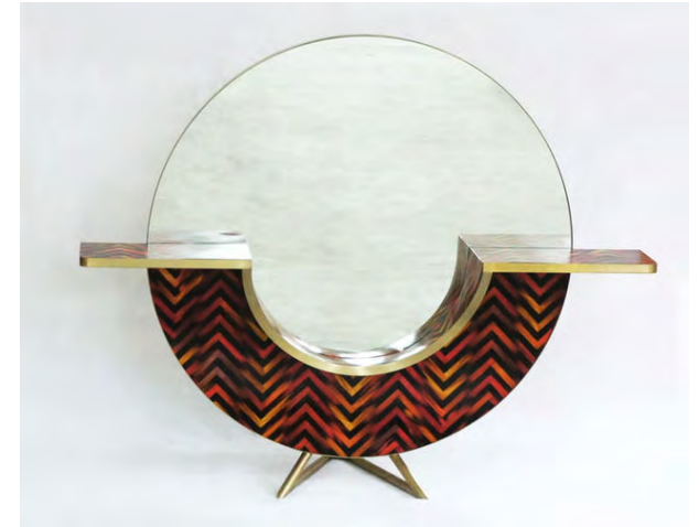
Studio Swine Hair series dressing table , 2014 Pearl Lam Galleries