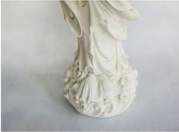
Bouke de Vries High-tech guanyin standing , 2014 Pearl Lam Galleries