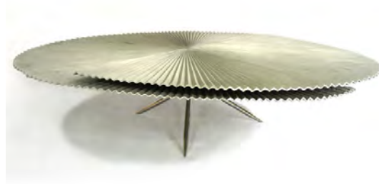
Reinier Bosch Skirt table casting , 2014 Pearl Lam Galleries