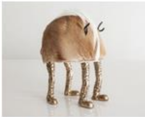
Thay Huan Zoulogu Self Portraits from the Street series with face Character Character from... X. Si Changyang