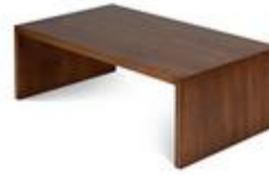
Sam Basso Office Table 2013 Calcutta Contemporary Gallery