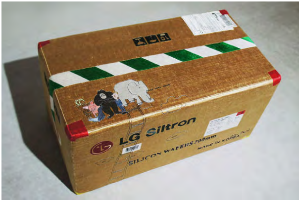
Danful Yang Packing me softly , 2014 Pearl Lam Galleries