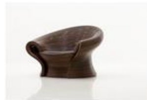
Yang Guo Gallery 2014